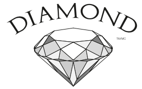
Diamond Lager Yeast vs. Cream Yeast (same strain)